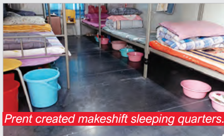
Prent created makeshift sleeping quarters.