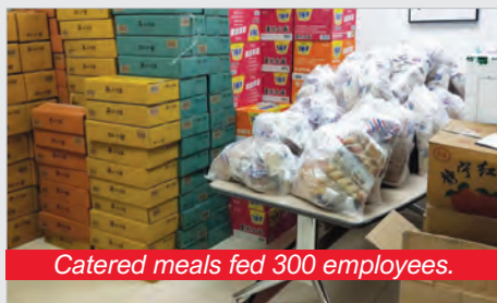
Catered meals fed 300 employees.