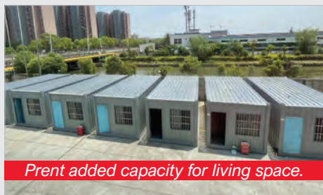
Prent added capacity for living space.

"The strong teamwork and commitment of our employees, our fast response with creativity, and the "never give up" attitude shown by our employees all successfully helped Prent navigate the challenges during this lockdown. We all came out of it stronger," Kuan said.