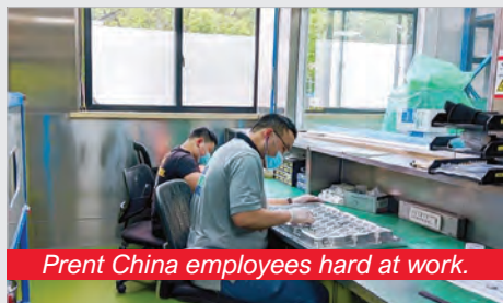
Prent China employees hard at work.